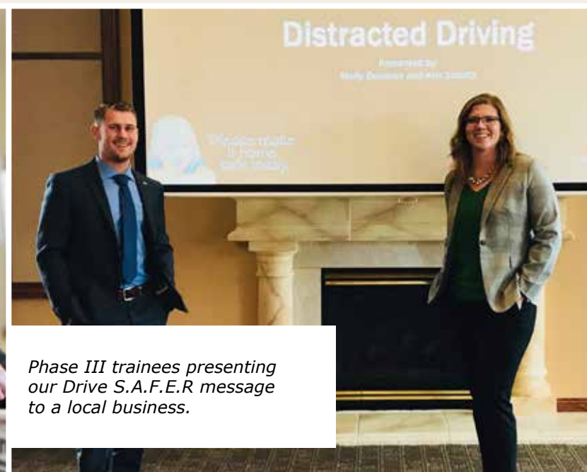
Phase III trainees presenting our Drive S.A.F.E.R message to a local business.