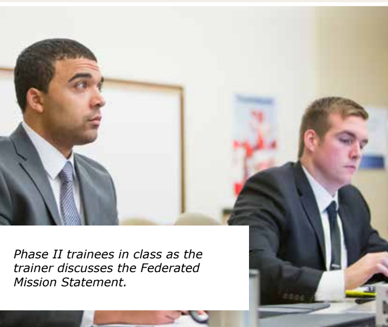
Phase II trainees in class as the trainer discusses the Federated Mission Statement.

Most trainees immediately relocate to their assigned territories. However, some trainees either do not have an assigned territory and/or are needed at the home office to service Federated clients in open territories.